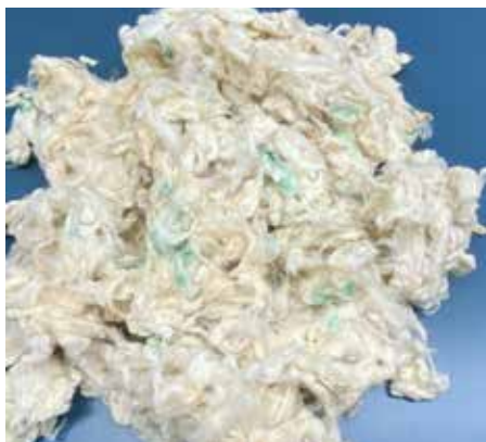
Brand in scoured wool

Sheep marking substances (Brands) are registered for use on wool. However, it has been shown that these substances are not always fully scourable. Processors are not able to determine the level of application, the weathering time or conditions, or if the marking fluid has been mixed with other substances. Because of these variables the Code of Practice states all sheep marking substances must be removed. See COP 22-24. Sec.2.2. v. p.15