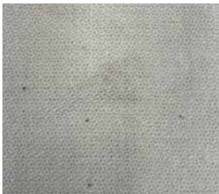
Skin flecks in fabric

Large skin pieces can damage wool processing machinery, small match head size skin pieces can break up causing specks/flecks in finished fabric. The Code of Practice states that all skin pieces must be removed.