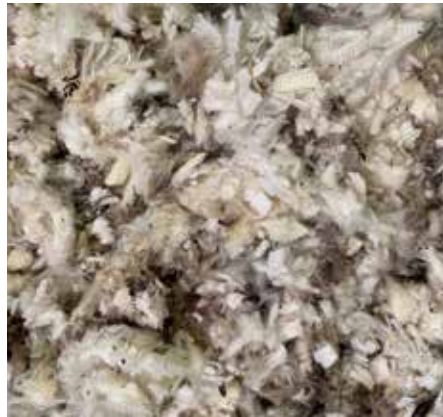
M LKS (Board and Table)

No, not always. In most cases board and table locks are to be combined. Locks consist of second cuts, short regrown crutch wool, loose individual sweat fribs and short soft shanks. Locks consisting of only second cuts will be white (Table Locks).