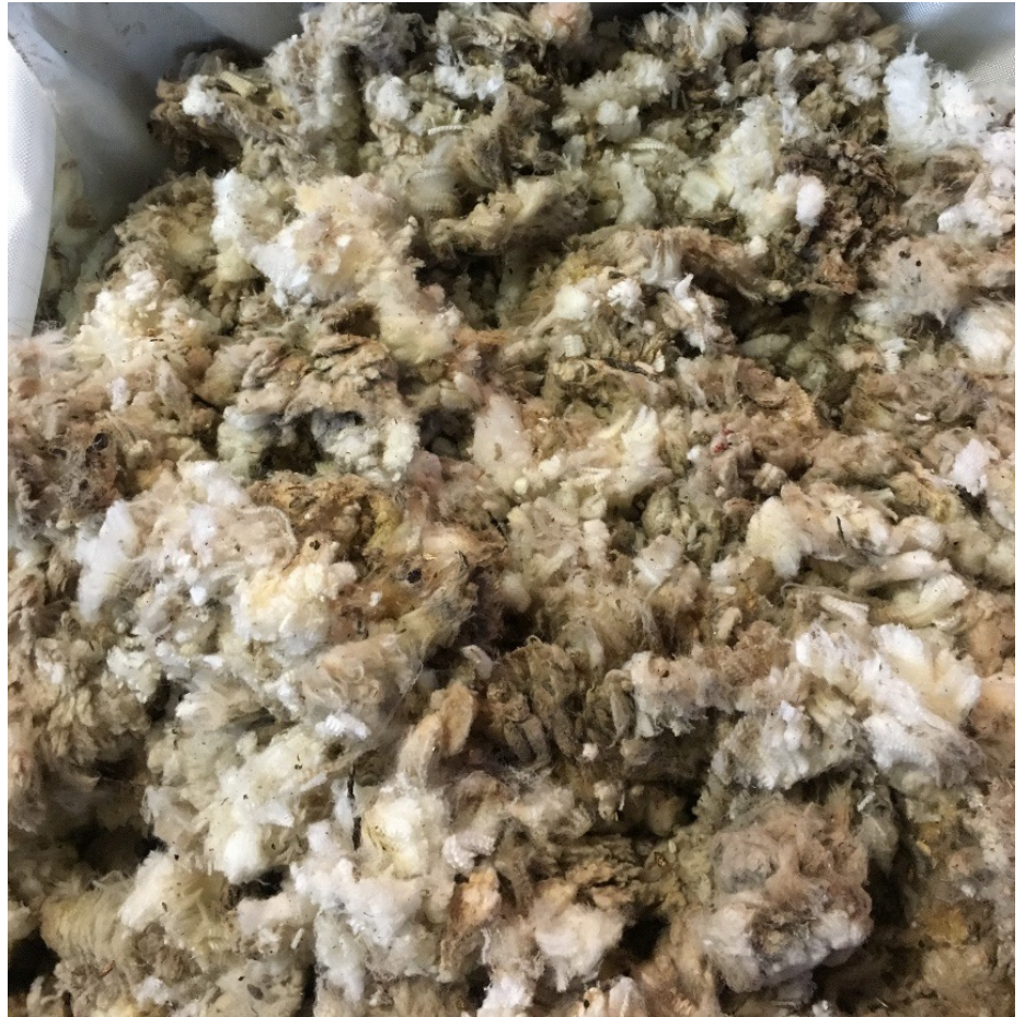
A well-prepared line of board and table locks.