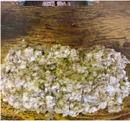
Board locks consisting of regrown crutch wool