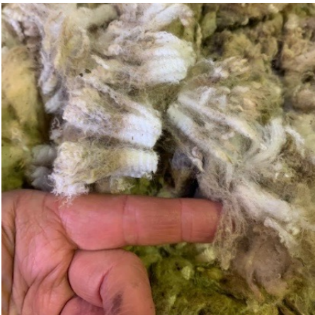
Locks from the breech of a crutched ewe.