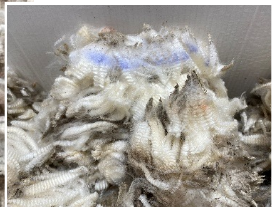
A High incidence of water colour has been observed by AWEX show floor Auditors from all regions.