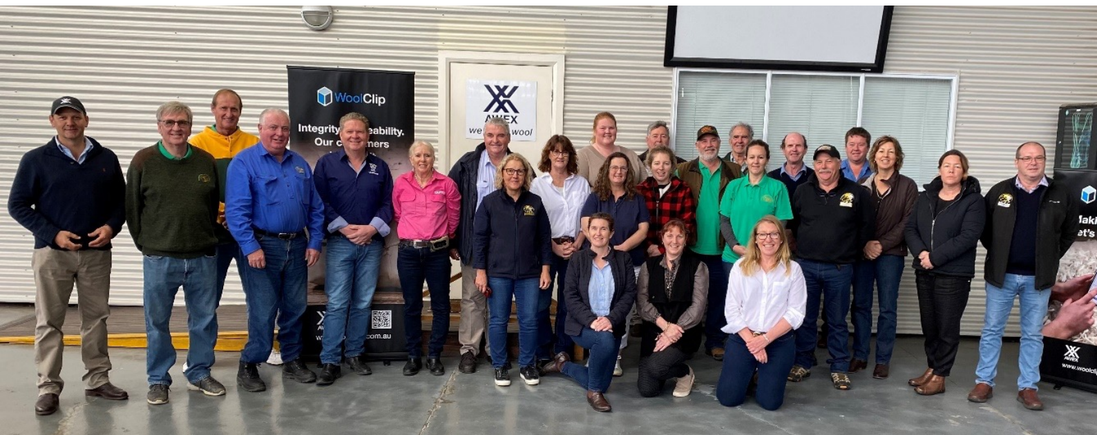
Training providers for NSW, SA, VIC, TAS and WA attended the National Wool Classing Trainers Workshop in Melbourne VIC.