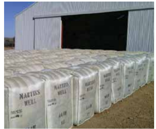
An excellent example of correctly pressed bales. AWEX would love to see more images of quality pressing. Follow us on face book or email to woolclasser@awex.com.au

Ensure a set of appropriate scales are available to the wool presser.