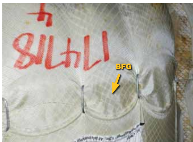
Bale Fastening Guide showing fasteners positioned on or past the guide

In terms of the preferred pack, the data showed that the reinforced pack fabric had no effect on reducing pack length; however, the 4-seam base was effective. The preferred pack, Variant 1 (standard pack with 4 seams sewn in the base), reduced the pack length on average by 8.5 mm.