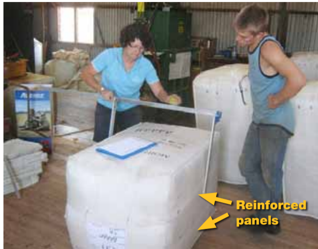
Measuring re-inforced bales on farm

The thirteen properties assisting with the trials were located in vastly different wool production areas of NSW and