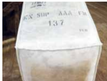
Pack with 4 seams at the base

To undertake the trials, AWEX staff travelled to properties and brokers' stores in NSW and VIC to evaluate and measure the packs under a wide variety of conditions.