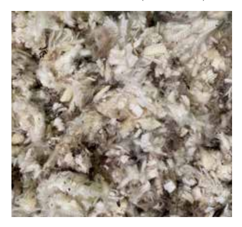
M LKS (Board and Table)

No, not always. In most cases board and table locks are to be combined. Locks consist of second cuts, short regrown crutch wool, loose individual sweat fribs and short soft shanks. Locks consisting of only second cuts will be white (Table Locks).